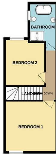
1ST FLOOR 366 sq.ft. (34.0 sq.m.) approx.